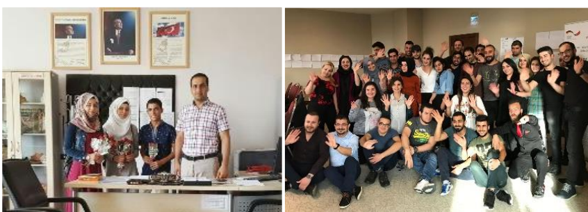
L. to r.: Syrian youth meeting government representative; training of youth leaders in Sanliurfa

The Dialogue for Social Cohesion is being organised by the Education Programme for Syrian Refugees and Host Communities (see box), with additional support from the Sector Programme Promoting Gender Equality and