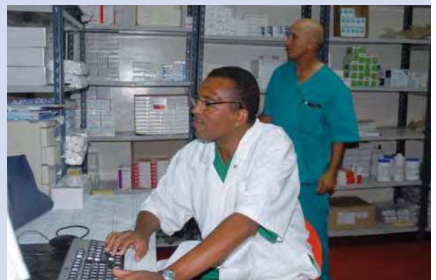
At Mohammed V Hospital, the staff team has given careful attention to improving pharmaceutical procurement and management.