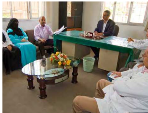
Holding his notes, a QIP Sadiq shares his observations with the assembled staff of a small hospital.

Several innovations emerged in the process of designing the QIP, chief among them the creation of a new type of process facilitator: the Sadiq .