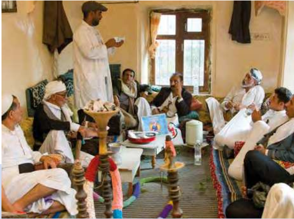
“Acceptable/patient-centred” care requires community consultation and, in Yemen, people are often more comfortable when this is done gender-by-gender.