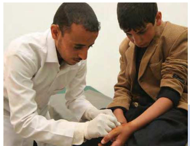
This Yemeni doctor has learned that treating every patient with courtesy, compassion and respect is essential to providing good health care.

Competition, certification and other rewards should never discourage weak institutions from doing their best to improve. This is especially so since the weakest institutions are usually the ones serving the populations in greatest need of improved health care.