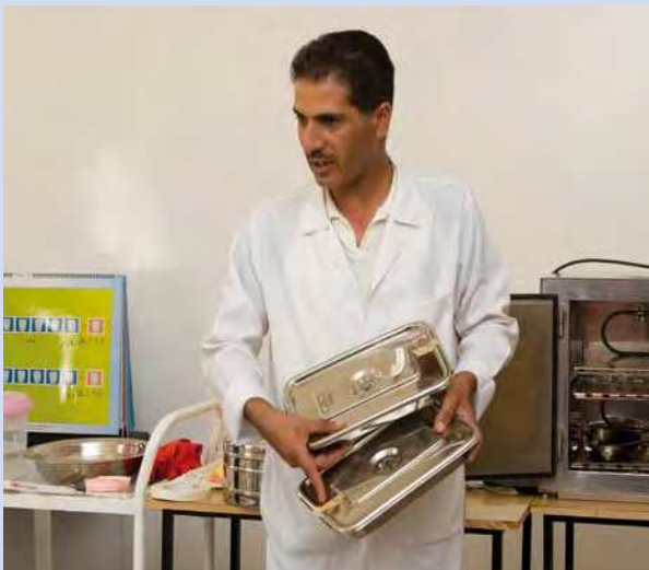
A QIP hygiene trainer showed Shibam Hospital staff how to sterilize equipment properly and stop unnecessary patient infections.

With guidance and support from QIP, staff began having weekly meetings where everyone’s contributions were welcome. Together, they found solutions to problems they observed during their daily rounds and, once per month, they reviewed the past month’s data on patients and revenue and agreed on how to allocate any surplus. They established better systems for recording patient data and they used that data plus demographic and health data from their catchment areas to draw up annual plans.