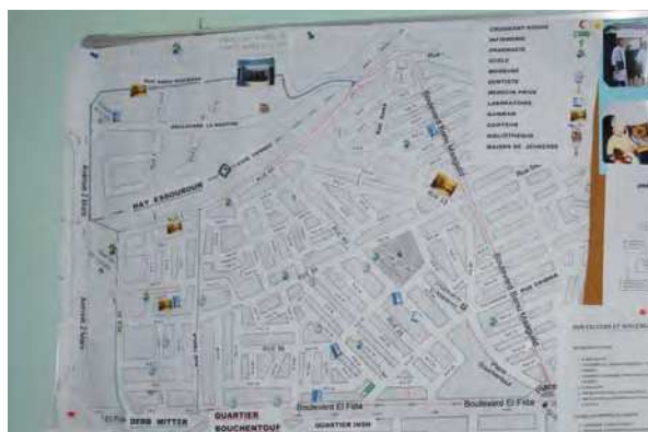
At Centre Santé Mers Sultan in Casablanca, a map of the neighbourhood, the pledge “Médicine Solidaire” and objectives to improve its services are posted at the reception desk.

For the 3 rd (2010) edition, measures to address such concerns included further enhancement of peer evaluator training sessions and the guidance manual. An effort was also made to ensure that peer evaluators were external – if not from outside the public health system at least from outside the Region where they were doing peer evaluations, and particularly not from institutions competing in that edition of the Concours Qualité .