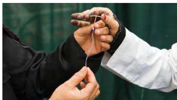
A QIP reproductive health trainer demonstrates how to give women explicit instruction on the correct use of a family planning device and make sure they have understood.

On-the-job training and material support. Typically, a Sadiq helps a staff team identify its training needs on the second visit and then arranges a training schedule that works for all concerned. The facility receives training provided by experienced experts in three areas: management of health facilities; hygiene and sterilization; reproductive health services. These experts have themselves attended specialized courses in training methodologies, with emphasis on interpersonal skills so they can offer guidance and support in a non-threatening manner. Based on the advice of the Trainer, equipment may be provided if the Trainer feels assured that the health facility will use the equipment properly.