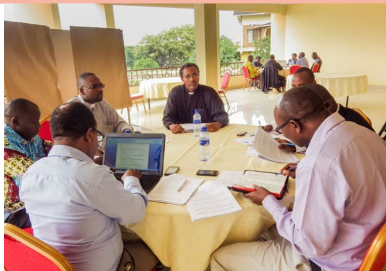
Validation workshop with religious leaders of the 'Jeunesse Victorieuse' tool

Launched in 2013, the Réseau des Confessions Religieuses pour la Promotion de la Santé et le Bien-Etre Intégral de la Famille (RCBIF) associates the Catholic and Anglican dioceses, the accredited missions of the Church of Pentecost and the Islamic community of Burundi. With its focus on 'integral family welfare' and community development, RCBIF places SRH in the overall context of the marital harmony of an ethically motivated couple who educate the younger generation on responsible sexual and procreative health. RCBIF has decentralised structures down to the hill level – the Ndemeshabuzima ('Health Promotion') Committees – which interact with churches, congregations, local government and health partners. RCBIF collaborates with a variety of partners and is active in the areas of community health, maternal and child health, and HIV/AIDS.