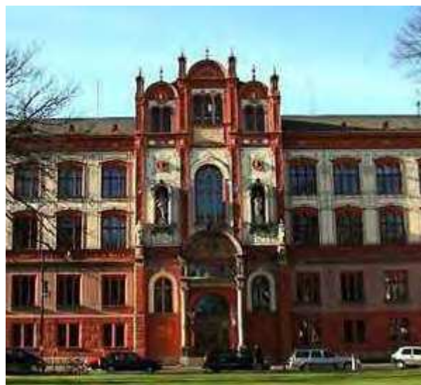
■ Rostock University is one of the oldest in Germany.

Founded in 1419, Rostock University in north-eastern Germany is the country's third-oldest university. It operates a hospital and several teaching and research institutes, with more than 1,500 students enrolled in the Medical Faculty's programmes. The hospital's Division of Tropical Medicine and Infectious Diseases consists of an in-patient ward with 19 beds, out-patient clinics for HIV and AIDS, tropical diseases, infectious diseases, travel medicine and Hepatitis B & C, as well as a Laboratory of Tropical Medicine and Parasitology. It runs a number of research projects on HIV, malaria, pneumocystis and schistosomiasis.