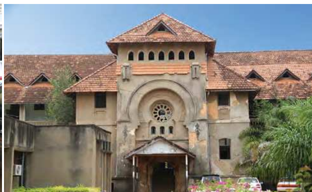
■ Tanga's original hospital, built by the Germans in 1894, and modern-day buildings.