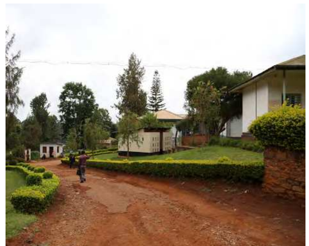
■ Lushoto District Hospital.

The Regional Health Office's Quality Coordinator had also noted these differences and requested, at the end of the first phase of the ESTHER partnership, that the lessons learned about continuous quality improvement should be shared with and extended to the five district hospitals. Although progress has been slow and somewhat uneven from hospital to hospital, the measures adopted by Lushoto District hospital are illustrative of the way in which the ESTHER partnership's benefits are now being shared across the region.