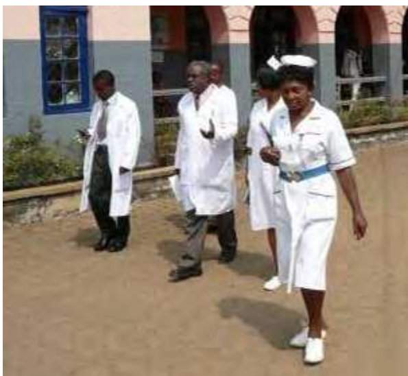
■ Limbe Regional Hospital is one of 23 approved HIV and AIDS treatment centres in Cameroon.

Limbe Regional Hospital is a 200-bed hospital in the South West Region of Cameroon and the region's principal referral hospital. Originally built around 1940, it now serves as a specialist referral centre for approximately two million people and has radiology, surgery, gynaecology and obstetrics, dental, ophthalmology, paediatrics, maternity and general medicine units. It is also one of 23 approved HIV and AIDS treatment centres in the country with laboratory services.