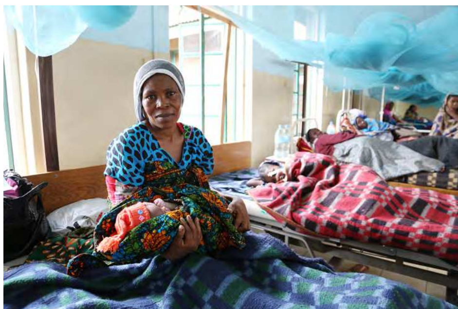
■ More deliveries, reduced maternal mortality at Tanga and Lushoto hospitals.

The partnership between Rostock and Limbe has also been a two-way learning process, with several joint research projects conducted and results published internationally. As already discussed, the first research project on pneumocystis - an important cause of pneumonia in HIV and AIDS patients which was not previously thought to have played a role in Africa - demonstrated that it is indeed present in HIV-positive patients in Africa and that treatment regimens need to take this into account (Kouanfack, 2009).