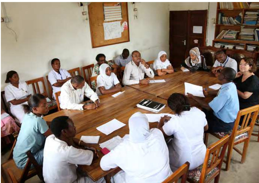
■ Quality circles draw up action plans for quality improvements.

Improved institutional capacities: The ESTHER partnership has not only changed the individual health workers’ behaviours and mind sets, it has also firmly established a culture of quality throughout the institution. Departmental self-assessments now take place on a weekly basis, and are complemented by biannual external hospital assessments, enabling the hospital to monitor its performance continually and to take corrective actions as needed. A hospital quality improvement team, 19 departmental and ward quality improvement circles and a full-time quality focal person for the hospital ensure that this culture is maintained and that quality improvements continue. They include, amongst many others, a more efficient hospital laboratory, where the time to complete full blood tests has been reduced from 24 to four hours, haemoglobin results now take 30 minutes instead of an hour and malaria results are available in five minutes. They also encompass measures towards a more patient-friendly hospital: ‘Uliza Hapa’ – ‘Ask here’, says the sign on the new information desk set up at the hospital entrance.