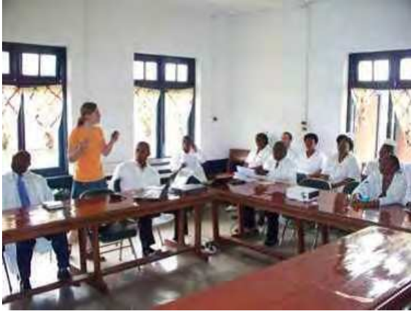
■ The ESTHER partnership has initiated a programme of continuing medical education for healthcare workers.

These annual workshops have helped to spread Limbe's new standards of workplace safety, diagnostics and care throughout the South West Region. The policy for dealing with needle stick injuries has been adopted by at least 10 other hospitals and health clinics in the South West Region, and other hospitals have been encouraged to refer patients or to send specimens for more complex diagnostic procedures to the regional hospital. As a result, Limbe's laboratory is rapidly becoming a regional reference laboratory for diagnostics related to HIV and AIDS.