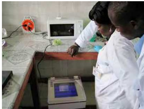
■ Training laboratory staff to conduct polymerase chain reaction tests for HIV and pneumocystis.

This investment paid off. As the Limbe doctors had expected, and contrary to the widely-held view that pneumocystis played no role in Africa, 42% of the HIV-positive patients and only 20% of the HIV-negative control persons were found to harbour pneumocystis in their lungs. This finding became the topic of a scientific article published jointly by the Cameroonian and German partners (Riebold et al, 2014), and now also informs doctors in Limbe that they always have to consider pneumocystis, among other possibilities, if an HIV-positive patient develops pneumonia.