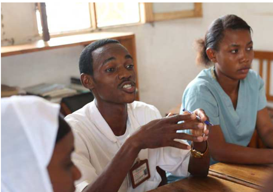
■ Tanga's quality circles meet regularly to discuss quality improvements.