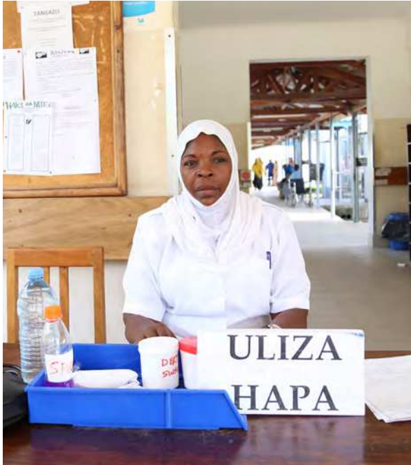
■ 'Ask here', says the sign on the new information desk.

Patients' rights as well as the costs of drugs and services are now clearly displayed on a sign at the hospital gates in an attempt to reduce corruption. Also, the hospital pharmacy is now open 24 hours a day so that patients can be given the drugs they need when they need them.